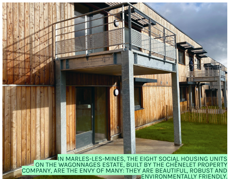
IN MARLES-LES-MINES, THE EIGHT SOCIAL HOUSING UNITS ON THE WAGNONNAGES ESTATE, BUILT BY THE CHÉNELET PROPERTY COMPANY, ARE THE ENVY OF MANY: THEY ARE BEAUTIFUL, ROBUST AND ENVIRONMENTALLY FRIENDLY.

Click here to download the full Barometer of social finance 2023-2024 (in French)